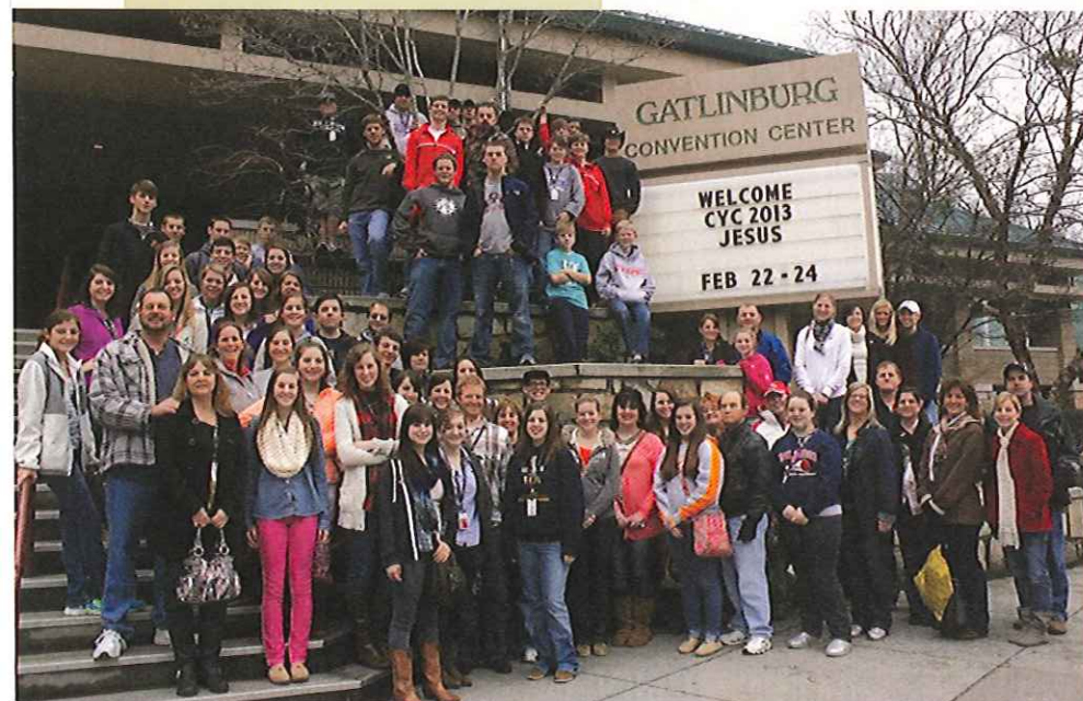
The West 7th Youth Group, from Columbia, Tenn., at the Challenge Youth Conference in Gatlinburg, Tenn.

It is my observation, having been to the conference for the last 13 years, that the organizers take a serious look at the things that seem to divide our fellowship. Without dictating to any individual